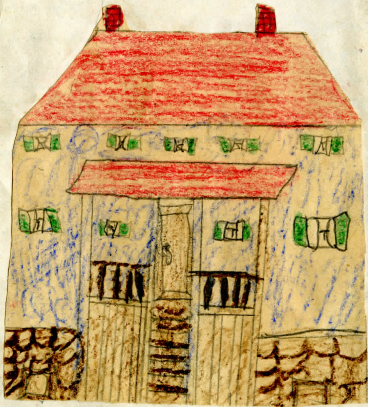
The front of my house